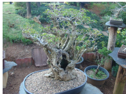
Mac's Bou- gainvillea

Ian Pringle—Waterberg Bonsaiklub—Ficus microcarpa, die publiek se tweede keuse.